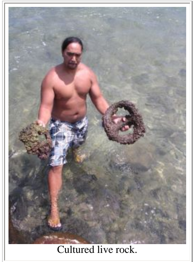
Cultured live rock.

In January, two independent MAC Accredited certifiers undertook a test Certification audit and evaluation of three companies: one in the UK and two in the US, to the MAC Mariculture and Aquaculture Management Standard. After showing their compliance with the MAM Standard, for their culturing activities of marine ornamental fish and, for one company, live rock, the three companies have successfully obtained the MAC Certification.