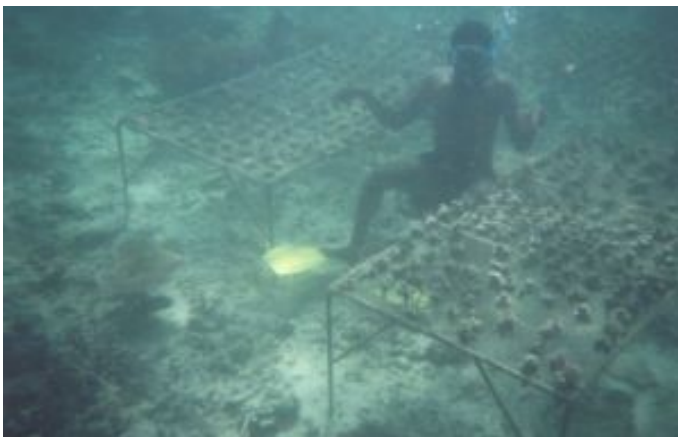
Coral Farm with propagated species.

For more information about MAC and the Mariculture and Aquaculture Management (MAM) Standard, please contact MAC at info@aquariumcouncil.org , and visit MAC website at www.aquariumcouncil.org .