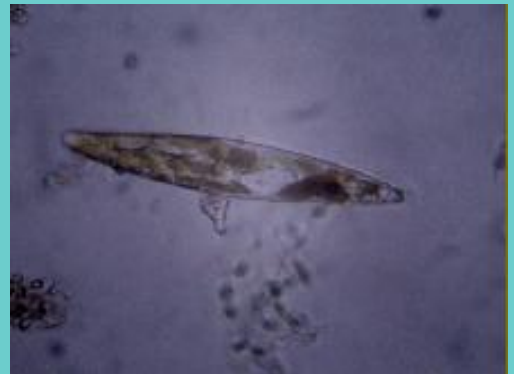
A 400x enlargement of what I believe to be a Nitschia diatom.