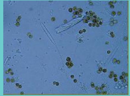
A "fired" nematocyst from an Aiptasia anemone.