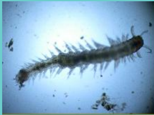
A 100x enlargement of what I believe is a Polychaete larvae.