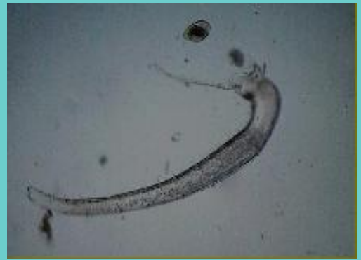
A 100x Enlargement of an unidentified micro creature.