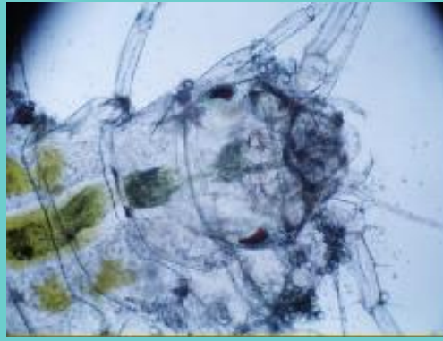
The same Copepod, enlarged 100x.