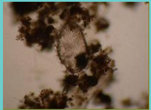
An unidentified small critter busy eating detritus (40x).