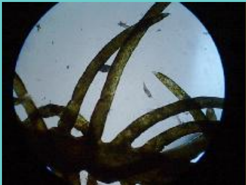
A 40x enlargement of a Fern Caulerpa "leaf", with some small critters visible.