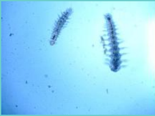
A 40x enlargement of two possible Polychaete larvae.