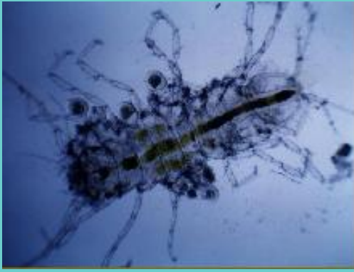
A large Copepod, enlarged 40x.