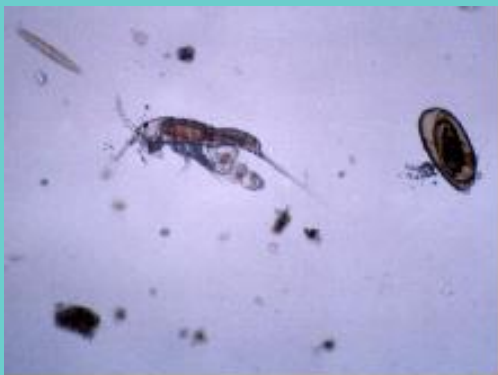
A small Copepod, enlarged 40x.